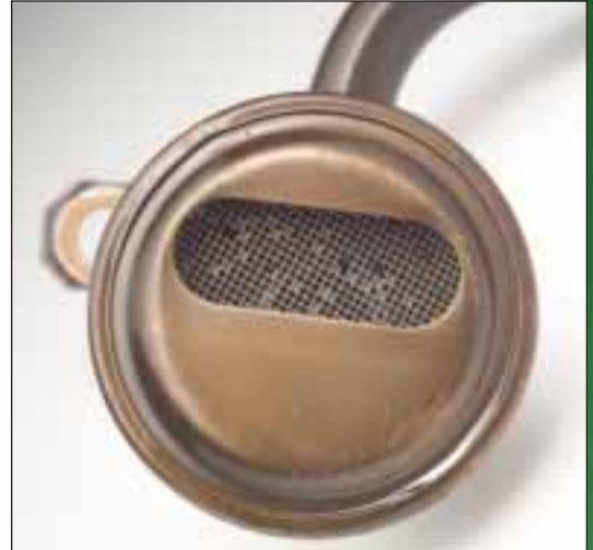
The oil pickup tube was very clean. There were minimal carbon deposits in the pickup tube screen..