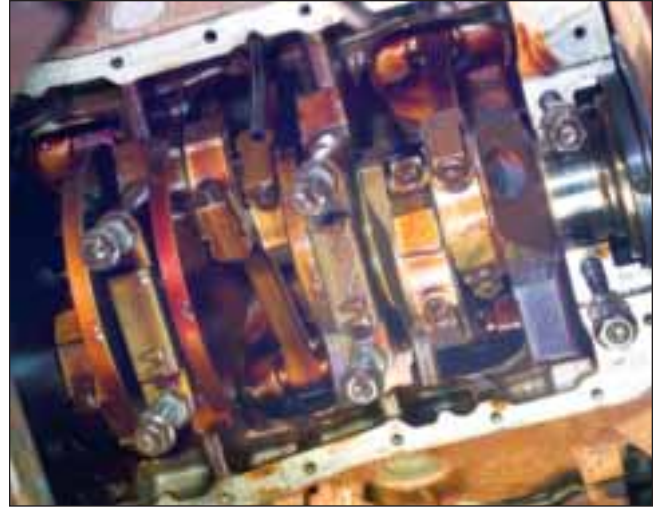
The lower crankcase area was very clean and free of any sludge deposits. The rear main bearing journal was removed showing no signs of visible wear on the crankshaft journal.