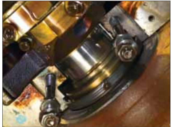
A closeup view of the rear main crankshaft journal. No visible wear detected.