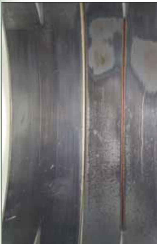
Engine main bearing halves show very little wear and are still suitable for continued use.

Each truck produces six quarts of waste-oil per oil change. With 60 vehicles being serviced every four months, that's 360 gallons per year. By switching to AMSOIL Guardian Pest Control prevents the disposal of 720 gallons of waste-oil every year. The environmental impact of this savings is enormous. It also frees up shop space that would be eaten up by drums of used oil.