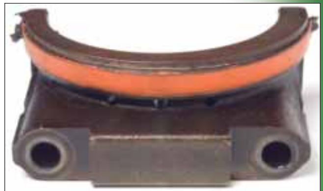
The rear main bearing cap and oil seal were in good condition. The rear seal was very pliable and still intact, showing no signs of deterioration.