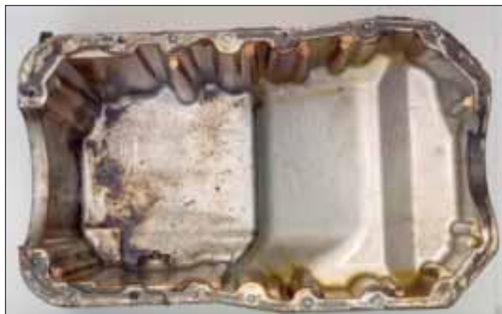
The inside of the engine oil pan was very clean. There were no sludge deposits found in the bottom of the pan.