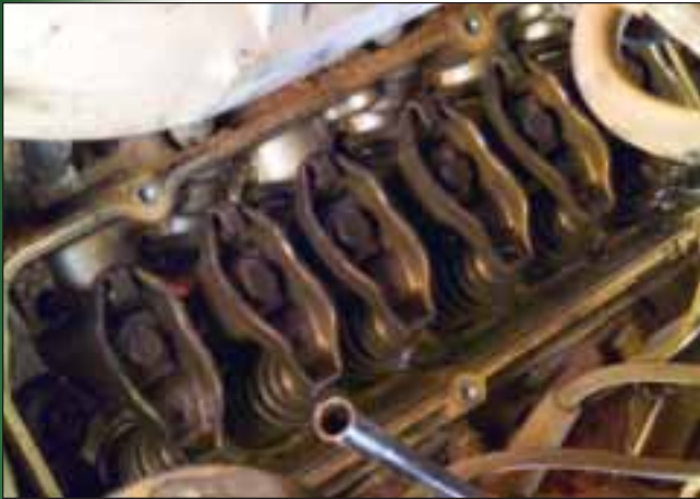
A wider view of the head and rockers. Very clean.