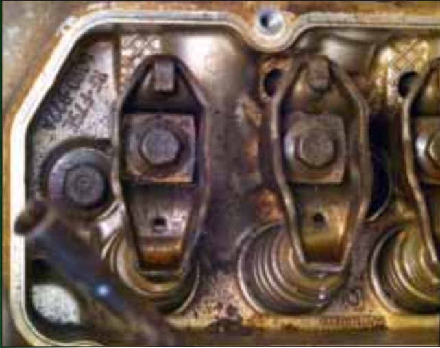
The head and rocker arms were very clean and free of heavy deposits. Note that you can still see the honey-comb stamping and manufacturer's part number. This is normally an area of the engine where you would see heavy varnish deposits with a conventional engine oil.